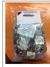
DHW Kit Package